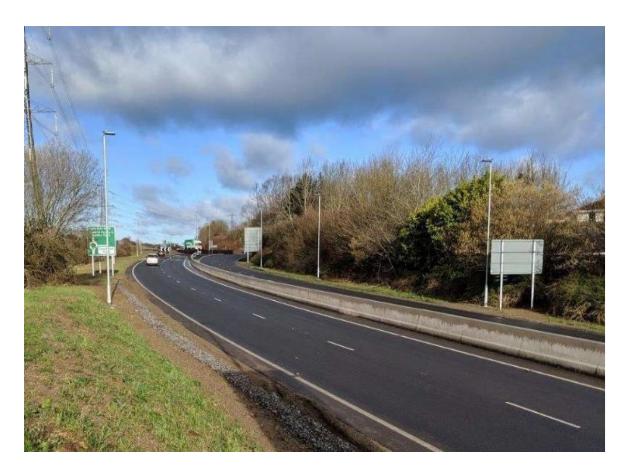
Previously dualled section of the Chippenham Bypass similar to current scheme

The A350 Chippenham Bypass (Phases 4 and 5) dualling scheme consists of the following elements: